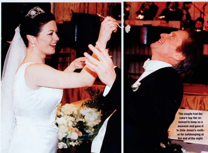
The couple had the cake's top tier removed to keep as a souvenir and gave it to Zeta-Jones's mother for safekeeping at the end of the night.