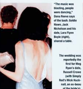
The wedding was reportedly the first for Meg Ryan's date, Russell Crowe (with Simply Red's Mick Huck-nail, an ex-beau of the bride's).