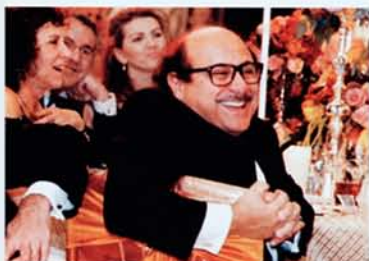
Douglas's friend of 30 years Danny Devito (enjoying the reception with his wife, Rhea Perlman, left) offered to sing with the Welsh choir and later danced with the bride. "I'm having a ball," he declared.