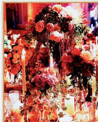
Beahm, who used 28 varieties of roses, recalls laboring over table settings with the bride. "We were picking out tablecloths, and the enormity of it all hit us," he says. "I said, 'Oh boy!' and she said, 'I know, darling!'"