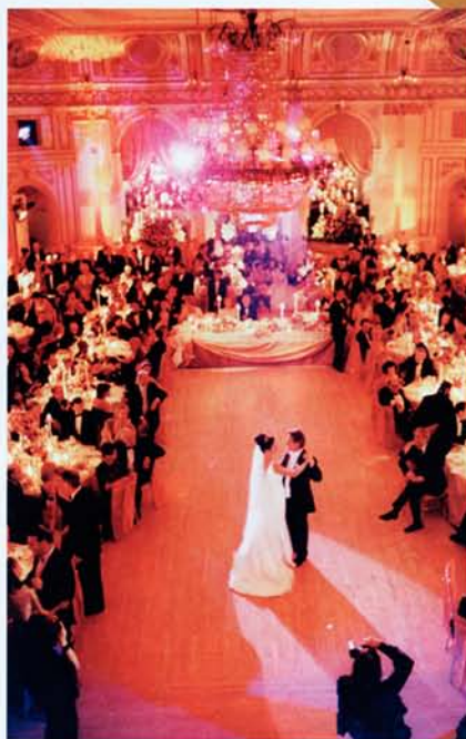
"Kirk [getting down with his daughter-in-law] looked great on the dance floor," Motion Picture Association president Jack Valenti says of Douglas Sr. "Those legs still work!"