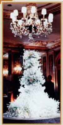
To fit in the ballroom, two tiers of the 6-ft., 10-tier, vanilla-and-butter-cream cake (covered with thousands of sugar flowers) had to be removed, then reassembled.